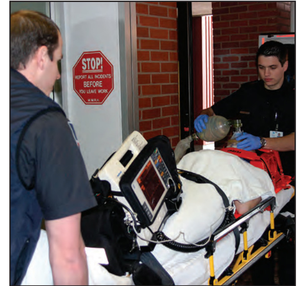
Sir Thomas Roddick Hospital Western Memorial Regional Hospital